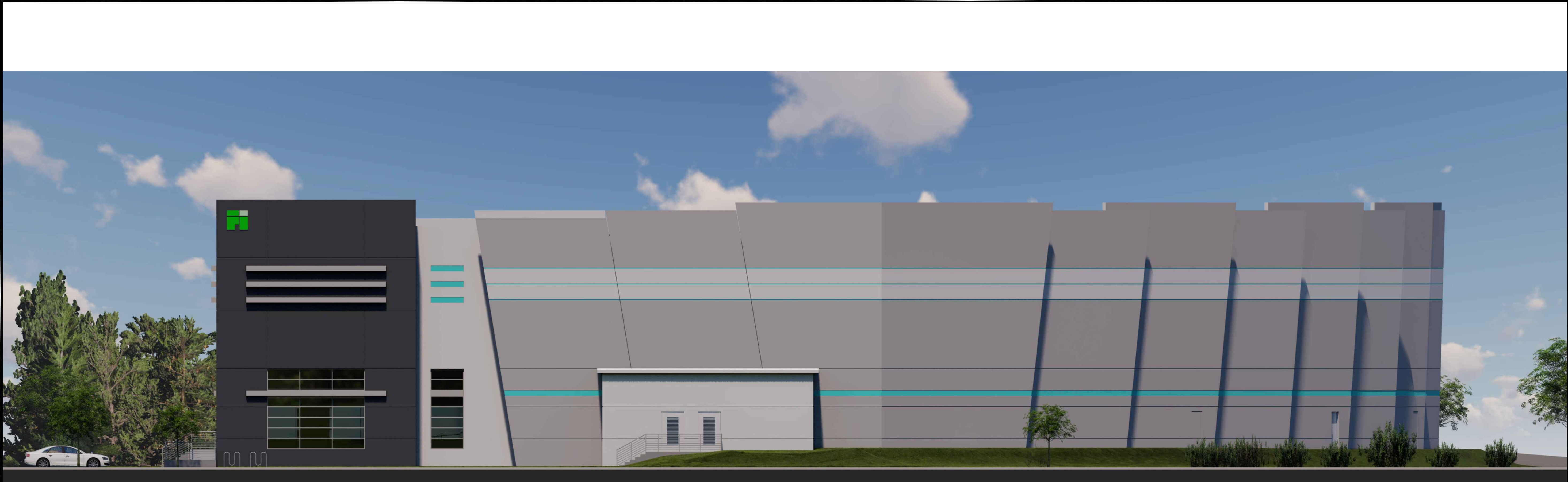
1 WEST ELEVATION N.T.S.